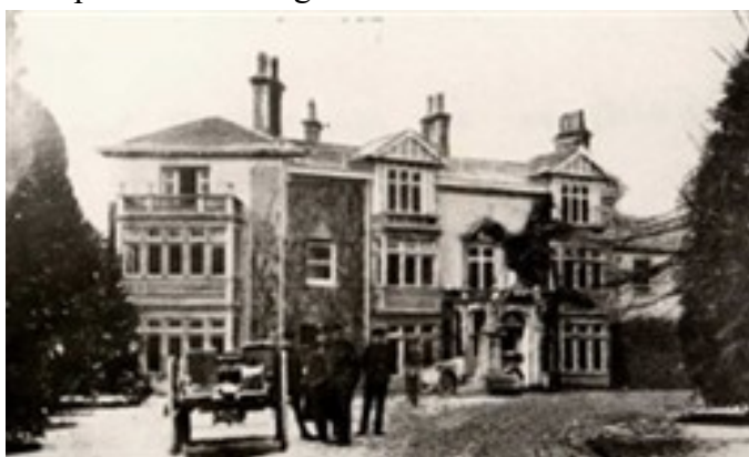
Staple Hall c1917 [Living Archive Milton Keynes Ref BCH/006/001]

At its height the Fenny Stratford Depot had “a large permanent staff of all ranks and its constant, though migratory, population of, say, from 1,500 to 2,000 soldiers” 3 . The camp hosted regular public concerts: it had its own band which played at regimental and public occasions and also boasted a string orchestra. The Depot was gradually run down after the Armistice. By 1919 it was still operational but had presumably lost its own bands and musicians so paid the Bradwell Band to play instead.