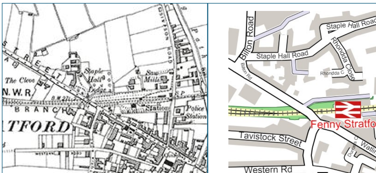
A 1900 map [left] of Fenny Stratford showing the location of Staple Hall in relation to Watling Street and the railway, and a modern street map [right] showing Staple Hall Road.

In June 1920 the Royal Engineers Signal Service became the Royal Corps of Signals.