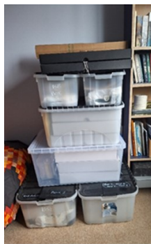
The Band Archive as it currently exists

I would also be interested in any items, photos, letters, papers or other things that people have related to the band, even if you do not want to donate them it would be good to photograph them and record their existence – especially if we do not already have copies or examples in the archive.