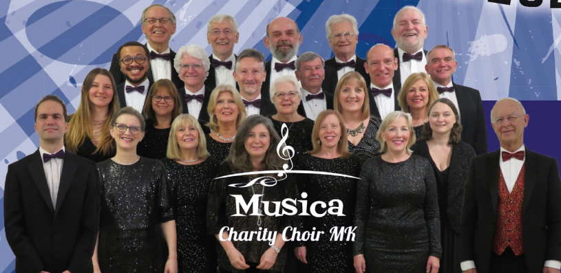
Musica Charity Choir MK

CHRYSALIS THEATRE JAPONICA LANE, WILLEN PARK, MK15 9JY.