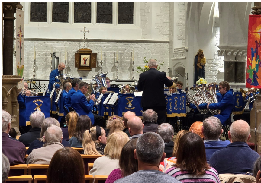
More photos can be found on the Band's Facebook page!