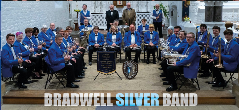
BRADWELL SILVER BAND

CHRYSALIS THEATRE JAPONICA LANE, WILLEN PARK, MK15 9JY.