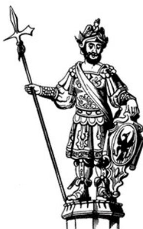
CORINEUS, THE GIANT IN GUILDHALL.