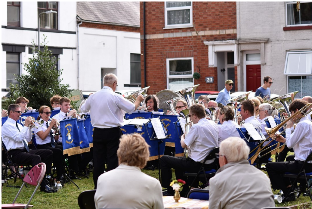
many more photos and some video clips can be viewed on Facebook!